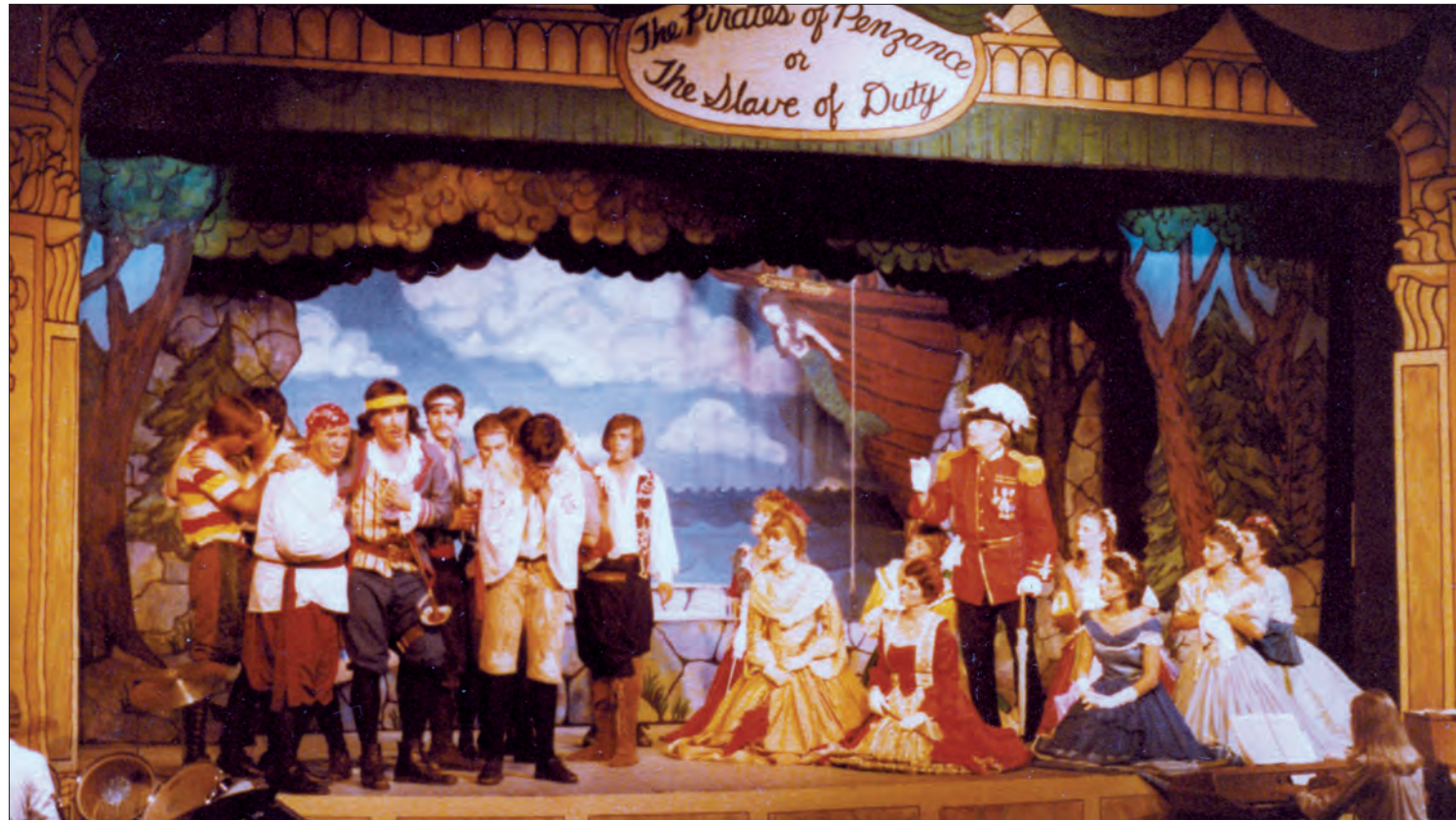
The Henry Street Playhouse picked up the G&S mantle in this 1982 production of The Pirates of Penzance .