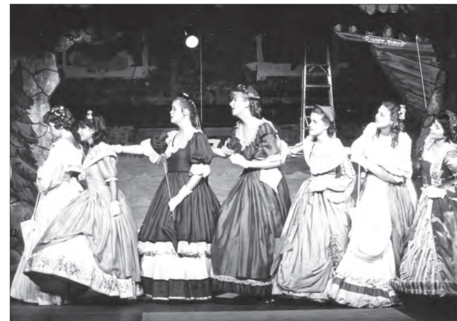
Below: The many daughters of General Stanley, the very model of a modern major general, in the 1966 Penzance production