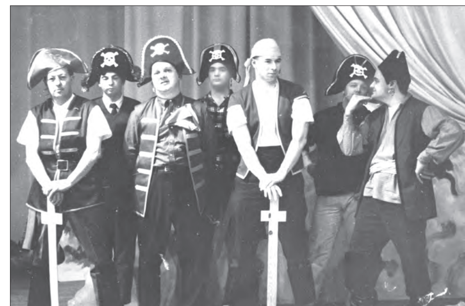
Above: "A Rollicking Band of Pirates We," proclaimed this FROGS ensemble in the 1966 production of The Pirates of Penzance .