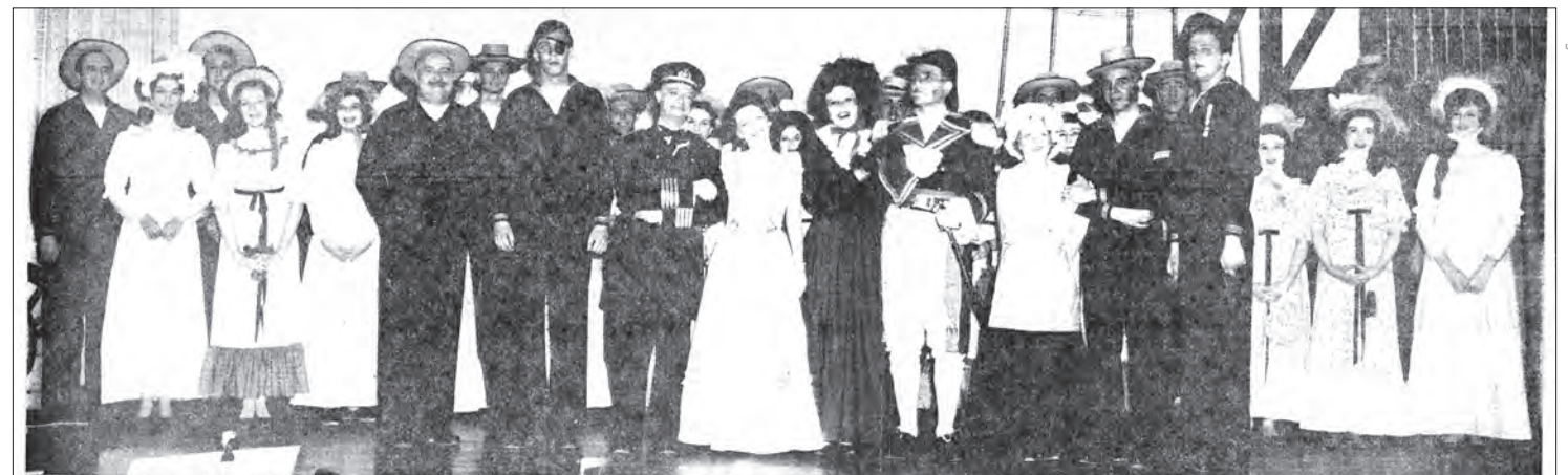
"SAIL THE OCEAN BLUE"—After taking many curtain calls, the cast for the local production of "H. M. S. Pinafore" assembles on stage for this picture. The highly successful event, staged Friday and Saturday nights at Waddell

Lexington's News-Gazette , the Buena Vista News , the VMI Cadet , Washington and Lee's Ring-tum Phi and the Roanoke Times . Headlines such as "Trial By Jury" Is A Legal Sensation In Audiences' Eyes" ( Rockbridge County News , April 27, 1944; page 2) trumpeted the