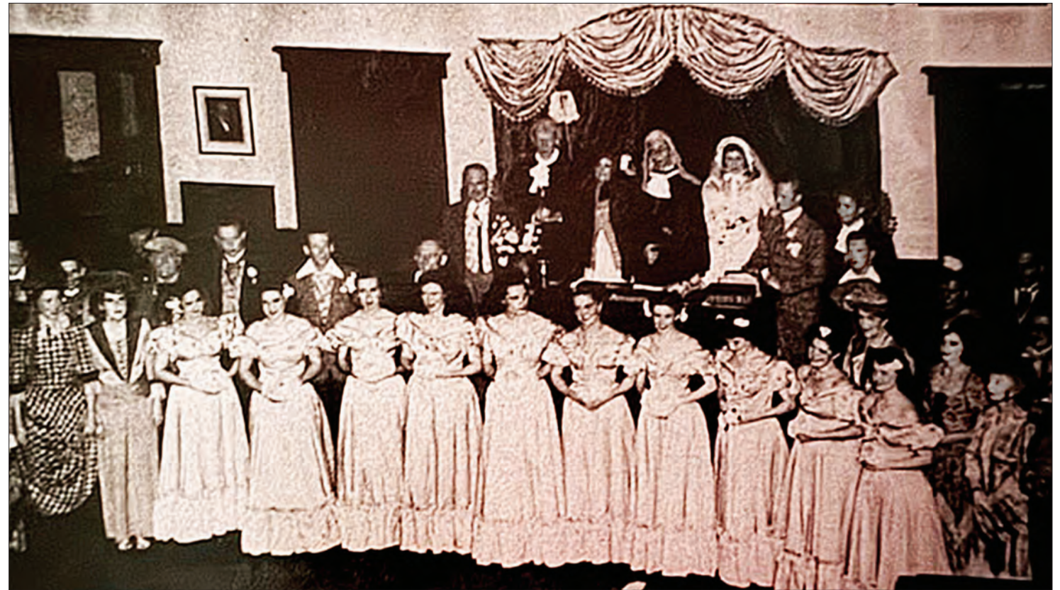
Above: Following its 1944 success, Trial by Jury was performed again in the Rockbridge County Courthouse in 1947.