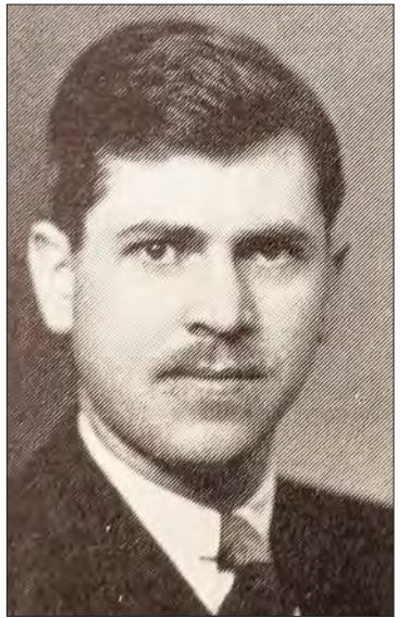
The author in his first year on the W&L faculty.